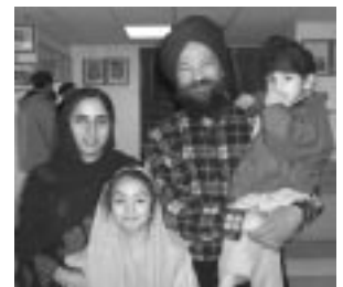
One of the photographs as part of the Sikh Community: 100 Years in the Pacific Northwest special exhibition at the Wing Luke Asian Museum.

Visit us online at www.wingluke.org for additional teacher resources to inquire about classroom and field trip activities, find information on EALRS, learn convenient avenues of transportation, where to park, and of course a list for the best lunch spots! Also, find out how to enhance your neighborhood visit by including a trip to the Tsue Chong Fortune Cookie and Noodle Factory, as well as several fun nearby businesses!