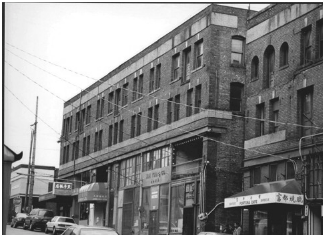
The historic East Kong Yick building, Wing Luke Asian Museum's future home.