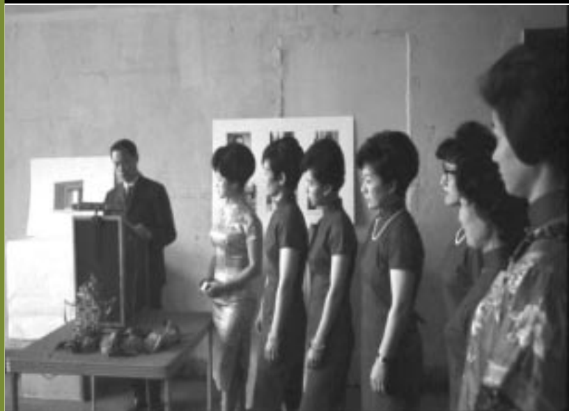
At the Museum's first groundbreaking ceremony on May 18, 1967. The Wing Luke Asian Museum received its nonprofit status in 1966 and opened to the public in 1967.