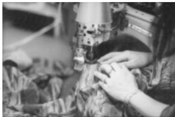
Wing Luke Asian Museum's 2001 documentary If These Tired Hands Could Talk is part of the 2006 NWA AFF.

Location for the closing night event is to be determined. Please check www.nwaaff.org , the Northwest Asian American Film Festival website, for the full schedule and ticket information. For questions, email pr@nwaaff.org .